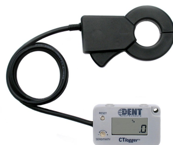
FOUR SMARTLOGGER™ MODELS AVAILABLE

The SMARTlogger™ TOU series of instruments are designed to monitor the On-Off status, Time-of-Use operating schedule, and Total On-Time for energy consuming devices and systems. Models are available for Lighting systems, Motors, Relays and Switches, and virtually any electric load. The non-contact monitoring makes installation simple. Each of these small, robust instruments provide powerful data for superior energy management.