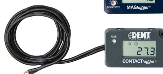
CONTACTlogger External Switch or Relay